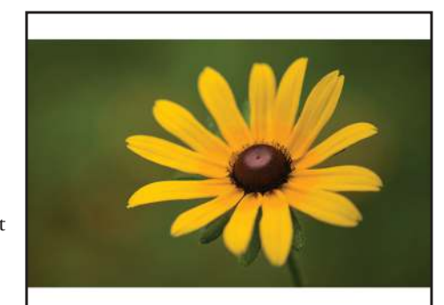
Nature's Gift by Stacie Leavitt Court of Honor: Non-Event Album