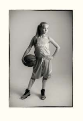
Self Assured by Barbara Tobey Court of Honor: Black & White