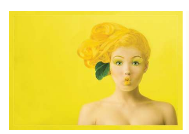
Lemon Tart by Lauren DelVecchio CPP Artistry in Photography