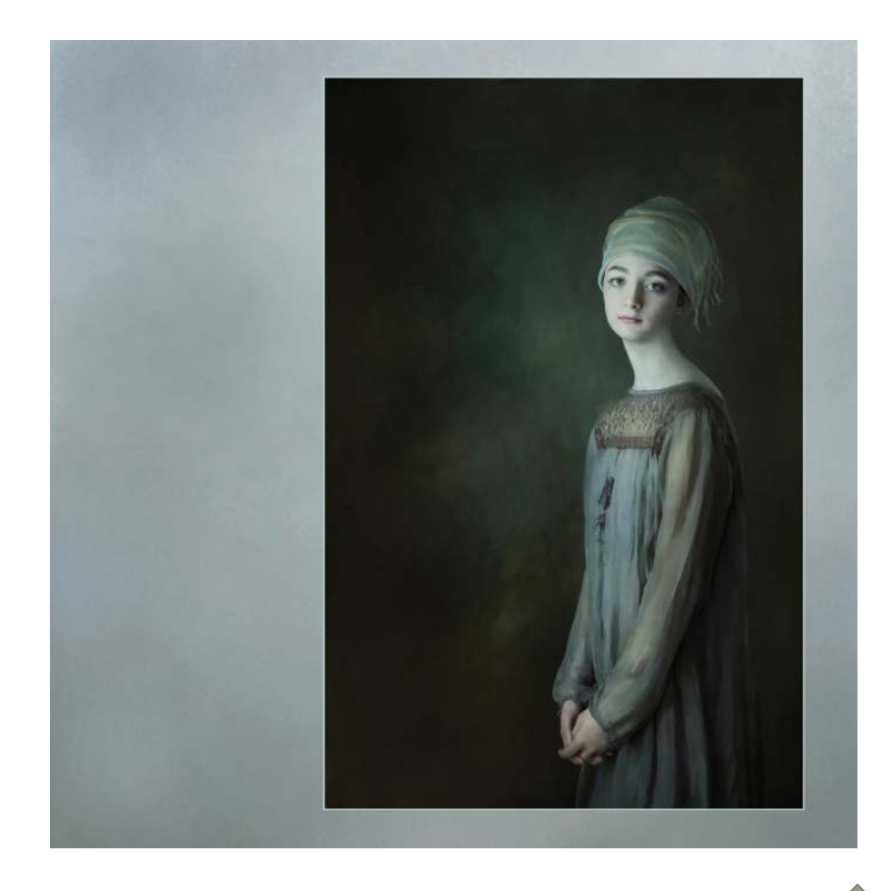
Maine Professional Photographers Association