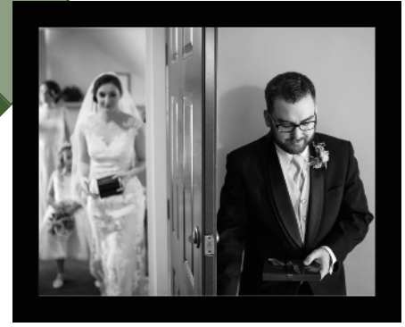
The Exchange by James Flachsbart First Time Entrant