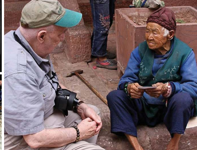
Maine Professional Photographers Association